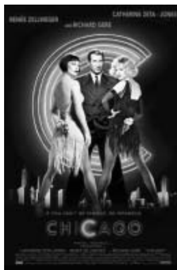
DIE ANOTHER DAY (MGM/UA), CHICAGO (Miramax), and THE EMPEROR'S CLUB (Fine Line) are just three recent smoking movies rated PG13. The smoking is meant to be noticed or it wouldn't be there. The movies are meant to be seen by young teens or they wouldn't be PG13.

Since 2000, when studios and theater owners cracked down on underage teens seeing R-rated films, smoking just followed the target audience. Four out of five